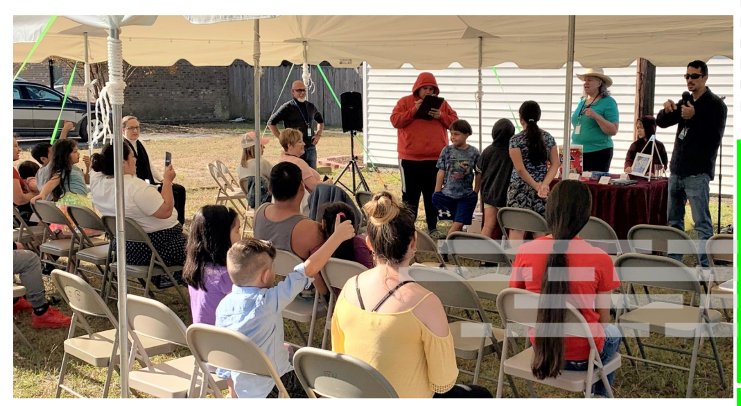
The kids loved "The Price is Right" game which taught the cost of Heaven. Free!!!